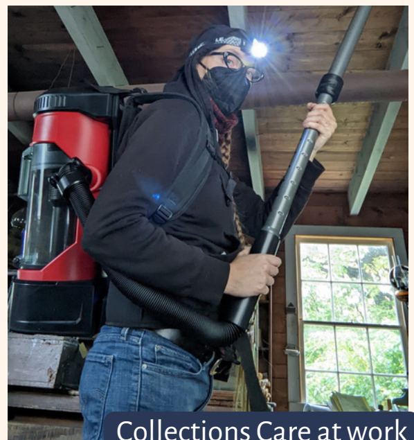
Collections Care at work