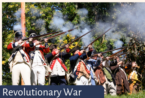
Revolutionary War Living History Saturday