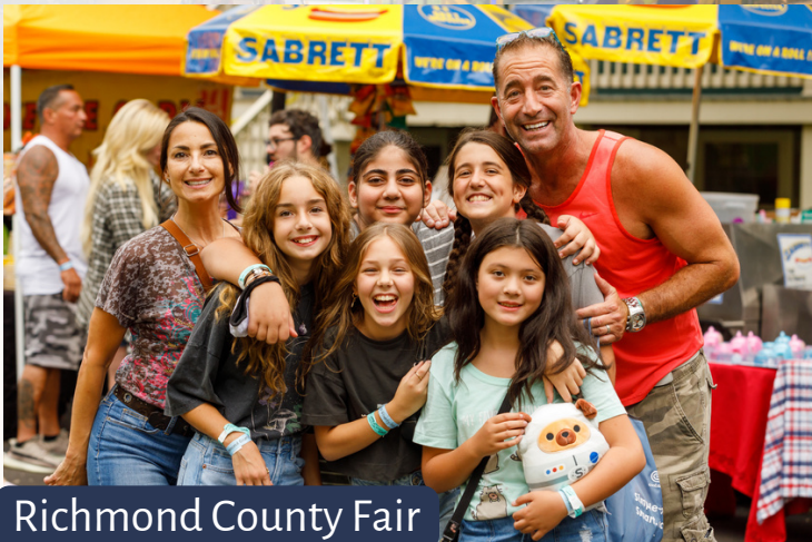
Richmond County Fair