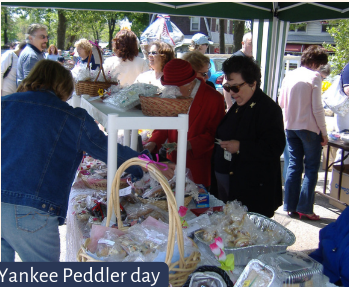
Yankee Peddler day