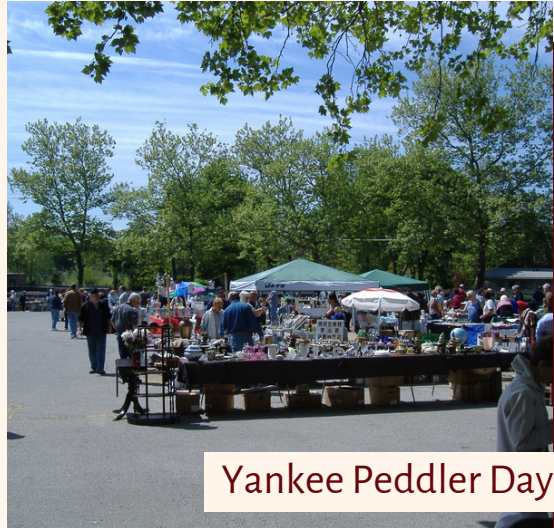
Yankee Peddler Day

In FY22, the WAUX experienced many challenges including Covid-19 restrictions, aging membership, and loss. Because of the dedication and commitment of the WAUX members, they saw new successes through volunteerism and creative fundraising events.