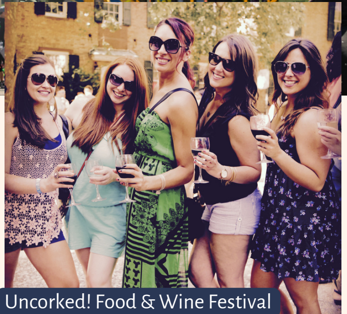
Uncorked! Food & Wine Festival