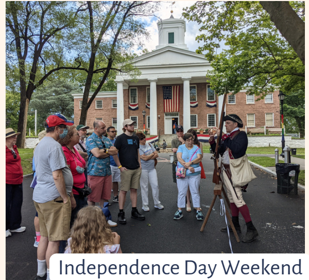
Independence Day Weekend

Historic Richmond Town's educational offerings, programs, and amenities fully returned in-person. Signature seasonal events that were adjusted or muted in the pandemic were brought back better than ever—including the Independence Day Celebration, Old Home Day, and Candlelight Tours. School program participation resumed for the first time since the pandemic, with over 3,000 students visiting the historic village and Decker Farm site.