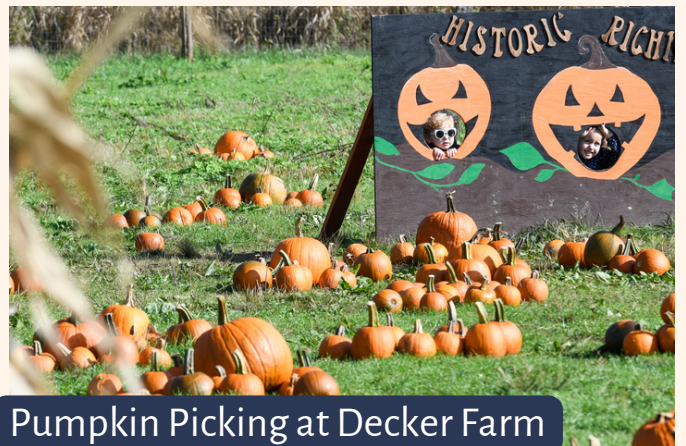
Pumpkin Picking at Decker Farm