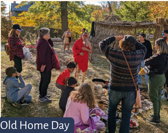
Old Home Day

Historic Richmond Town's educational offerings, programs, and amenities fully returned in-person. Signature seasonal events that were adjusted or muted in the pandemic were brought back better than ever—including the Independence Day Celebration, Old Home Day, and Candlelight Tours. School program participation resumed for the first time since the pandemic, with over 3,000 students visiting the historic village and Decker Farm site.